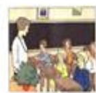
the class die Klasse