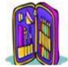
the pencil case das Mäppchen