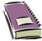
the book das Buch