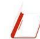
The folder die Mappe