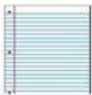
the paper das Papier