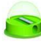
the sharpener der Spitzer