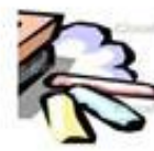
The chalk die Kreide