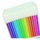
the colour pencil der Buntstift