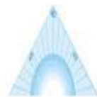
the triangle das Geodreieck