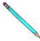
The pencil der Bleistift