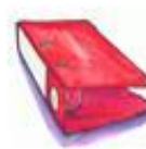
the file der Ordner