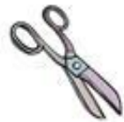
the scissors die Schere